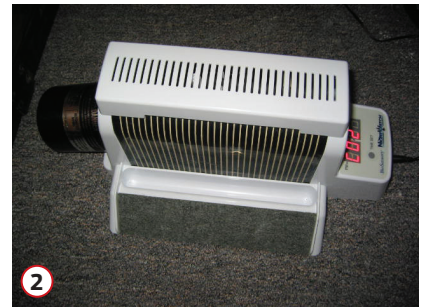
Figure 1. Three tested active bed bug monitors; 1) CDC 3000, 2) NightWatch and 3) dry ice trap.