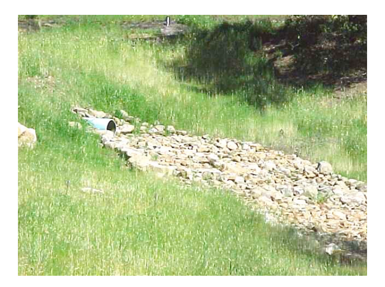
Figure 2. Culvert draining into a rock dissipater