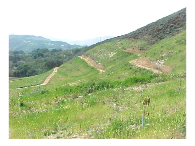
Figure 1. Access roads on a slope in a new grove

When determining the design of your access road system several guidelines should be followed: