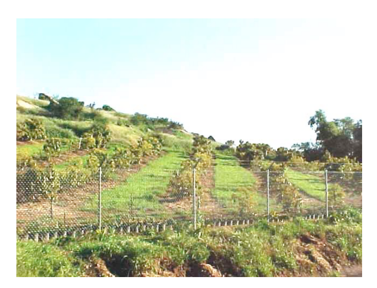
Figure 4. Cover crops planted between young trees on a slope.

desirable resident species not including any noxious weeds that provides at least 60 percent ground cover during the erosive period. Plant height shall be controlled by mowing. As the trees grow and the canopy shades the cover crop it is slowly eliminated. It should not be allowed to grow around the sprinkler as this will disrupt the spray pattern and result in poor distribution to the root zone.