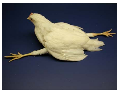
Figure 2 . Paralyzed chicken with hurdling stance.