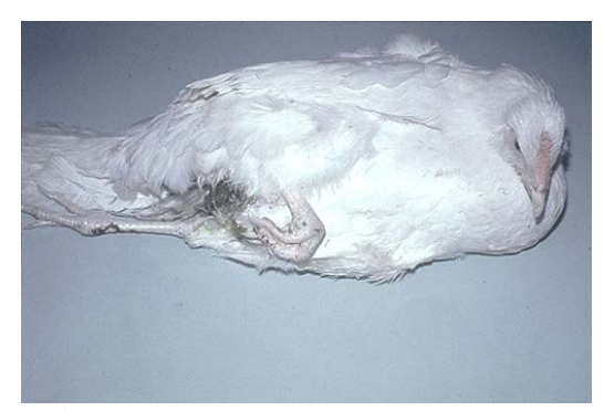
Figure 3 . Chicken with one paralyzed leg and one normal leg.