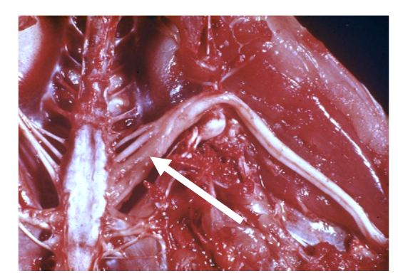
Figure 1 . Sciatic nerve; left normal, right enlarged with tumor (arrow).