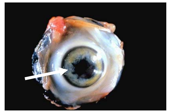
Figure 6 . "Gray eye" (discolored iris) and irregular pupil size.