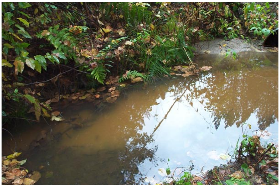
Figure 3. Roads and stream crossings are the main sources of sediment that negatively impacts streams in California's forests.

Anadromous trout and salmon may migrate many miles up and down streams during their lifetimes. Resident trout also move up and down streams to seek food, shelter, and spawning habitat. Culverts under roads can interfere with this migration, blocking passage by making fish jump too high, removing resting pools, and creating streamflow conditions that are too shallow or too fast.