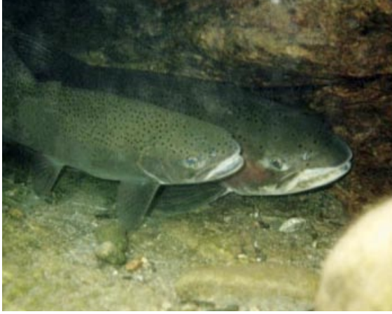
Figure 1. Steelhead trout in the Trinity River, below Lewiston Dam. The dam prevents access to miles of suitable spawning habitat upstream. Photo: Richard Harris.

their yolk supply. The timing of fry emergence is determined by water temperature during incubation. Normally, fry emerge in the spring, and, depending on the species and stock, the young fish can remain in fresh water streams or lakes 1 to 2 years before migrating to the ocean.