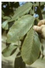
Chandler on Northern California Black ( J. hindsii ) rootstock