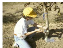
Bark cores were collected from both rootstock and scion the first year