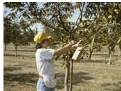
July leaf samples were collected over a 2 year period.