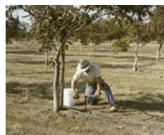
Soil samples were collected the first year