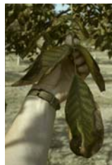
Chandler on English ( J. regia ) rootstock