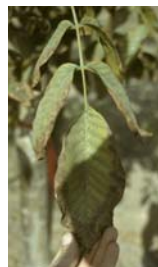
Chandler on Paradox ( J. hindsii x J. regia ) rootstock