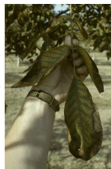
Chandler on English ( J. regia ) rootstock