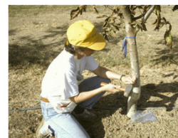
Bark cores were collected from both rootstock and scion the first year