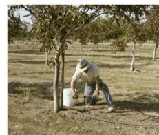
Soil samples were collected the first year