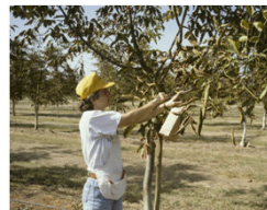
July leaf samples were collected over a 2 year period.