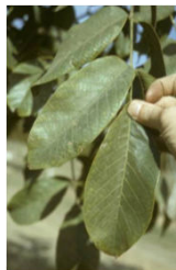
Chandler on Northern California Black ( J. hindsii ) rootstock