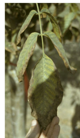
Chandler on Paradox ( J. hindsii x J. regia ) rootstock