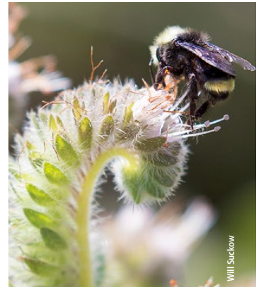
Above, bees visit wildflowers in a hedgerow: a honey bee on elegant clarkia ( Clarkia unguiculata ) and a bumble bee on California phacelia ( Phacelia californica ).