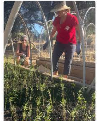
A Master Gardener volunteer demonstrates planting techniques during a class at the Heritage Rose Garden in Jackson, Amador Co.