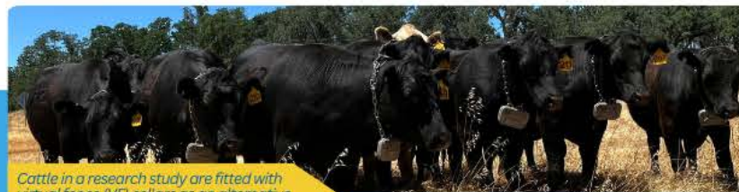
Cattle in a research study are fitted with virtual fence (VF) collars as an alternative to traditional fencing in Lone, Amador Co.