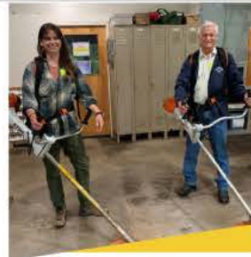
Two local forest landowners learning how to use and maintain appropriate hand tools for vegetation management. June 10th, 2023 at Blodgett Forest Research Station, Georgetown, CA.

The RPF visit typically leads to the development of a forest management plan and implementation of forest management activities, improving overall forest health and resiliency, and reducing the negative effects of wildfire.