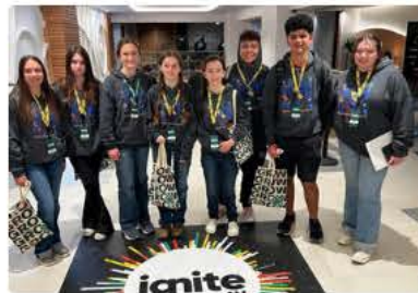
Eight Central Sierra youth attend the Ignite 4-H summit in Washington, D.C. to learn about pollinator habitats and develop a service project to implement in their communities. The goal for the next several months is to teach hundreds of local students about pollinators and increase pollinator awareness.