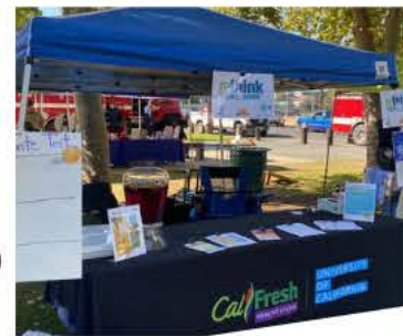
CalFresh Healthy Living hosted taste tests and information booths at local community events in Calaveras County.

2,461 people reached by healthy food and/or physical activity changes (CFHL, UC)