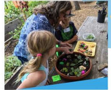
Pictured: Calaveras Master Gardeners help students to plant a miniature garden.

The original program was very simple, but through the years has expanded to include a vegetable garden, a native plant area, and also a native tree area. Every 3rd grade student for over 20 years has received an intensive garden education. Students are able to eat what they grow, which increases produce consumption.