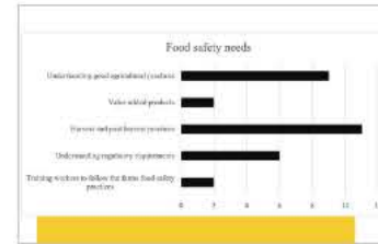
Graph depicts the needs as shared by the respondents in terms of food safety. It was found that harvest and post harvest practices including the Good Agricultural Practices (GAP) were of most interest to the growers.