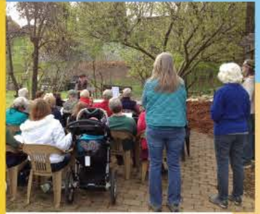
Pictured: Tuolumne Master Gardener giving a presentation at the monthly Open Garden Event