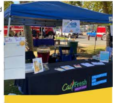
CFHL, UCCE booth at the Infant and Child Enrichment Services "Children's Fair" event, offering nutrition information and an infused water tasting station. September 2023.

CFHL, UCCE also provided nutrition education to schools in Tuolumne County. Harvest of the Month tastings were conducted at Columbia Elementary and Twain Harte School, wherein students had the opportunity to sample seasonal produce items in the cafeteria during lunch. These efforts resulted in 240 students at Twain Harte School and 310 students at Columbia Elementary taking part in Harvest of the Month.