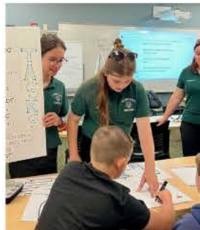
Ozobots Session at Mad About Science Summer Camp. July 2023, Columbia College

The week-long event includes engaging activities such as building bridges, robots, launching rockets, creating slime, and making lava lamps. Mad About Science aims to foster a love for STEM subjects and inspire student's curiosity in the world around them. Our 4-H Team instructed facilitated Ozobot workshops for four 5th grade classes. Participants learned teamwork, coding and all about robots!