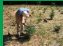
Growth measurements of Nordmann and Turkish fir are compared to local White fir in different microclimates.