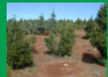
Turkish and Nordmann fir seed sources will be screened for Phytophthora resistance in naturally infested field sites like this one.