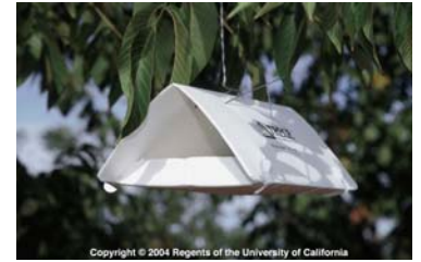
Kairomone vs. Pheromone Trap Catches