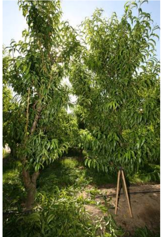
Picture 3. Heavy summer pruning (tree on left) approximately 60 days before harvest significantly reduced corking over no summer pruning (tree on right).

As such, on those varieties and blocks known to have problems with corking, growers should avoid stimulating excessive vigor. Most importantly, in seasons in which March and April temperatures are significantly cooler than normal, trees should probably be summer pruned sometime in May or early June by significantly reducing the number of total growing points.