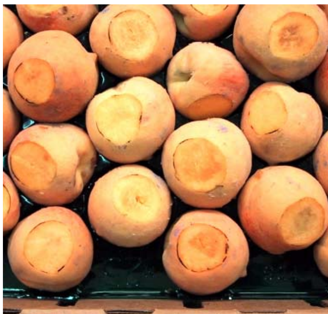
Picture 1. Peach showing bruises after harvesting, hauling and packaging operations.

light conditions, delaying harvest beyond “California Well Mature” increased fruit size. In some cultivars fruit red color also increased, and in a few, there was the perception of an improvement in flavor. These potential delayed harvest benefits can be improved according to orchard conditions.