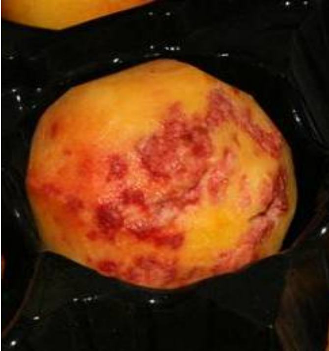
Picture 2. Internal Corking Symptoms.