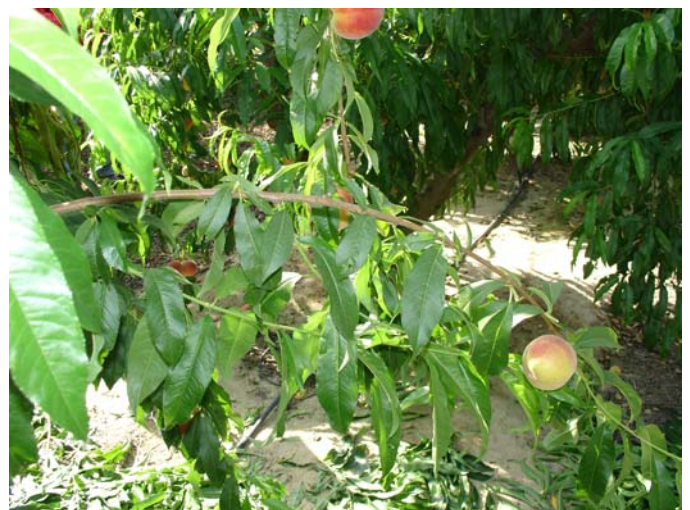
Picture 4. Detailed view of heavy summer pruning showing removal of many shoot growth points.