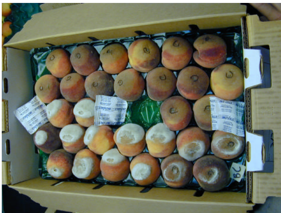
Fig.1. Decay development on inoculated peaches packed with and without potassium permanganate sachets. In the bottom picture, the upper two rows were inoculated with gray mold and the bottom two rows were inoculated with brown rot.