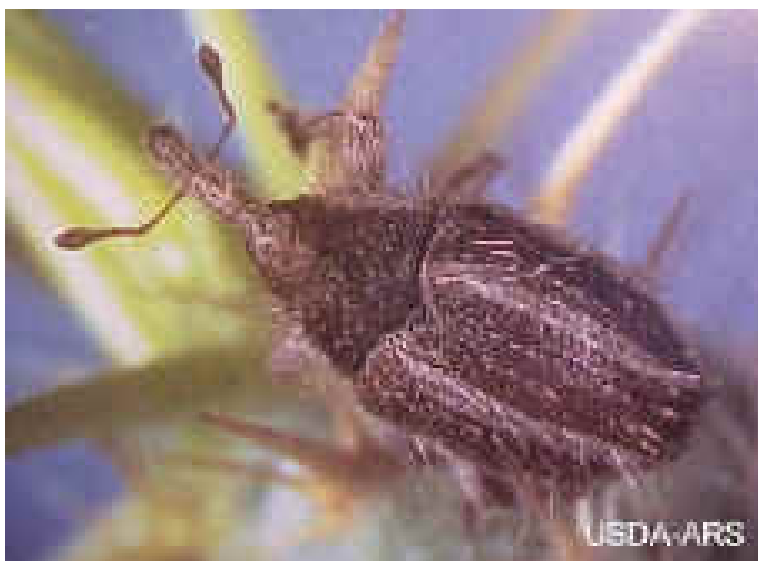
YST hairy weevil ( Eustenopus villosus )