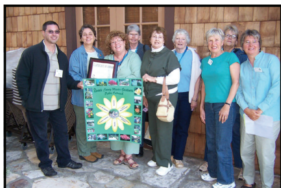
The UC Nevada County Master Gardeners pose with their FIRST PLACE award at the 2008 Statewide Master Gardener Conference.

The gardening needs of Western Nevada County are as diverse as its natural setting and its inhabitants. Our organization is continually refining our program and our skills to meet these needs. The goal is to provide varied paths to learning so that people of all ages and experience can take steps in developing