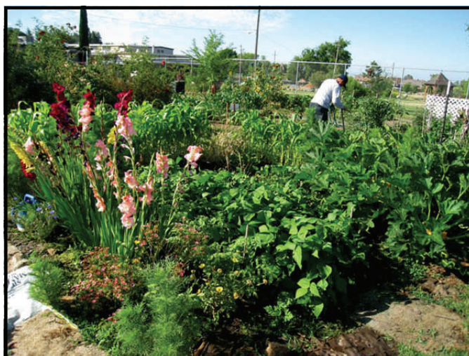
A Senior Gardener tends to his plot while other gardening plots grow and flourish around him. The gardening plots are thriving and the Senior Gardeners are happy.

Recently, in 2006, the Senior Garden was relocated to a more appropriate spot and improved in many ways. Fencing was installed to protect the gardens from critters and people. Irrigation was installed so that each plot (30 total) has access to their own spigot and can water more efficiently. A beautiful garden shed was placed on-site for tool storage. The areas around the garden outside of the plots has been slowly taking shape and is now planted with fruit trees, bamboo, vines, and other shrubs. Overall, the Senior Community Garden is gradually becoming a model for community gardens everywhere.