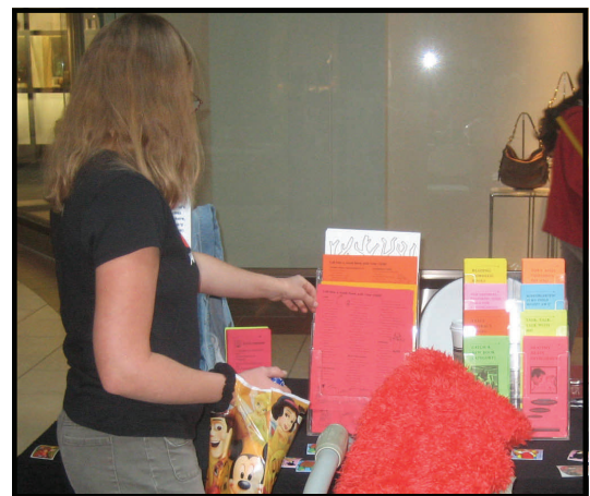
Mommy & me at Galleria at Roseville is an excellent source for distributing informational brochures.