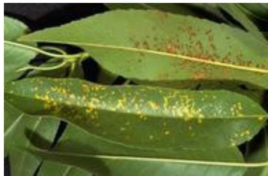
Fig. 2. Almond Leaf Rust