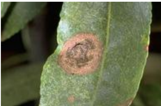
Fig. 1. Alternaria Leaf Spot

http://ipm.ucdavis.edu/PDF/PMG/fungicideefficacytiming.pdf