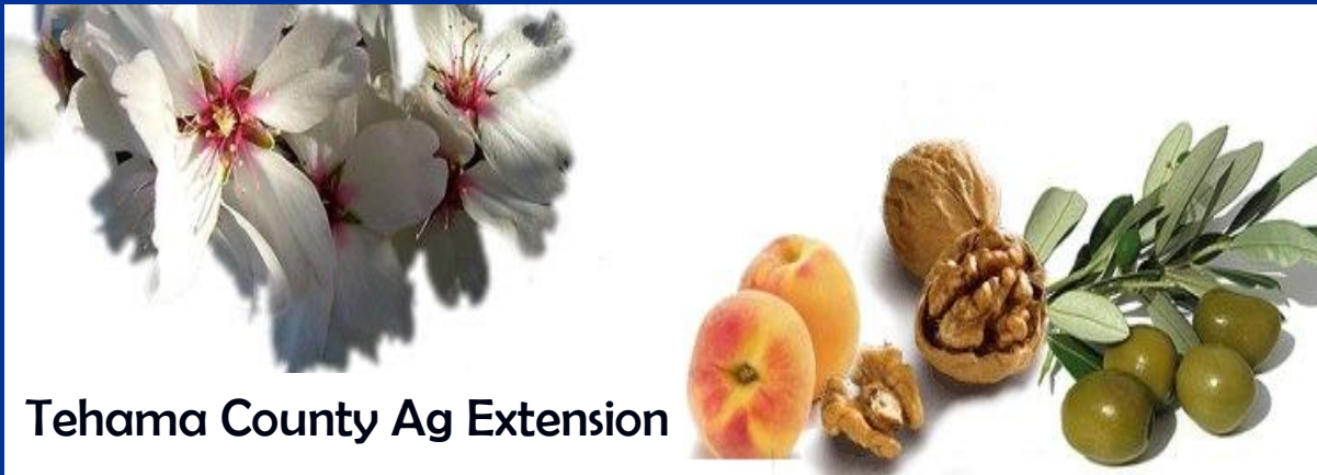
Tehama County Ag Extension