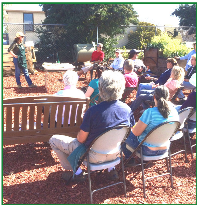
Master Gardener volunteers in Placer County give a public workshop at their Demonstration Garden in Auburn.