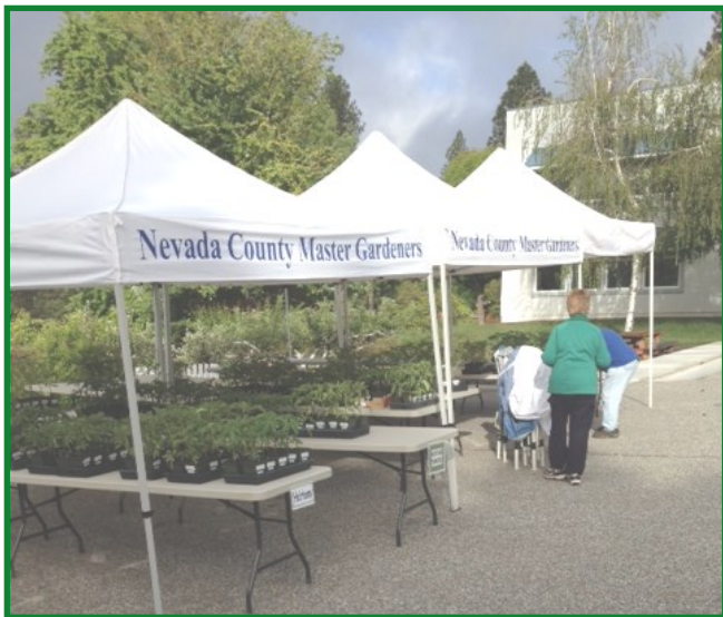
Master Gardener volunteers set up their Annual Plant Sale fundraiser at the Nevada County Demonstration Garden in Grass Valley where hundreds of local plant lovers get their vegetable starts for the upcoming growing season.

The Master Gardener programs in both Placer and Nevada Counties held many public workshops at their Demonstration Gardens this past year. These workshops allow community members to not only learn about the topic presented but also bring their own questions and network with other gardeners in the area. In 2013/14, the Master Gardeners put on over 30 workshops at their Demonstration Gardens reaching over 500 gardeners in our communities. Evaluations were collected for workshops and the response was almost unanimously positive about the quality of the workshops and the Demonstration Gardens themselves. In an effort to enhance both garden spaces, the Master Gardeners are looking ahead to add more features and signage in the Demonstration Gardens over the next year.