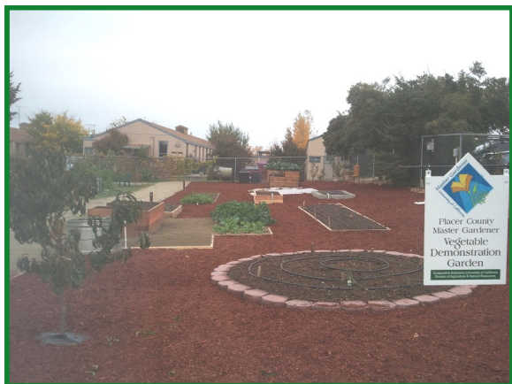
Placer County Master Gardeners Edible Demonstration Garden.

From a Senior Gardener, “The opportunity to garden here is something I really appreciate, because I live in an apartment, and I don’t even have a balcony for containers.”