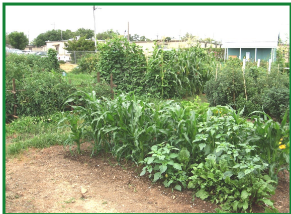
The Senior Community Garden plots produce a lot of produce. Some of the surplus is donated to the Auburn Food Closet.