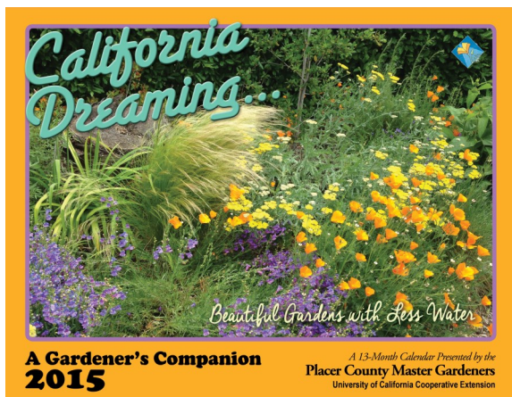
The Placer County Master Gardeners have focused their 2015 annual calendar on “Beautiful Gardens with Less Water”.

As more and more questions come in to the Master Gardener offices regarding the drought conditions, we are poised to have a variety of resources at hand to share with the public. From written materials like the annual calendar to web resources online to demonstrating what a water-efficient landscape looks like, the Master Gardeners have done an excellent job quickly developing resources to meet the needs of our communities. In this way, they serve the home gardening community a full plate of options when inquiring about how drought conditions affect their gardens and what to do about it.