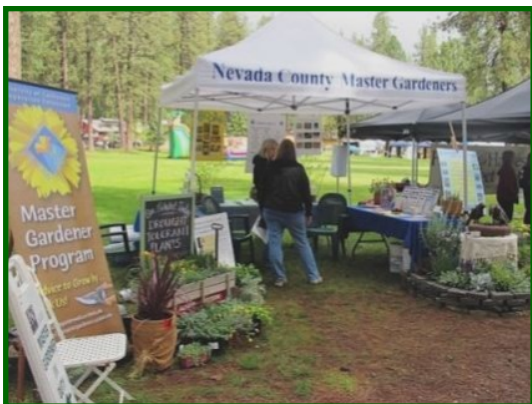
Master Gardeners answer questions at community events like the Home and Garden Show hosted by The Union Newspaper.

In the spirit of community building, the Master Gardeners have expanded their educational venues through collaborations with various cities and local organizations.