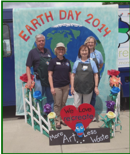
Master Gardeners at 2014 Earth Day event in partnership with Roseville Utility Exploration Center.

In the spirit of community building, the Master Gardeners have expanded their educational venues through collaborations with various cities and local organizations.