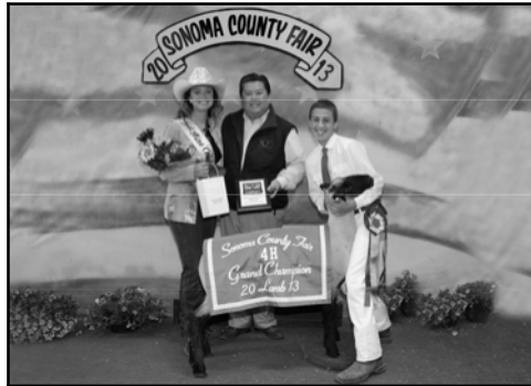
Exhibited and sold by Davey Dorr, Healdsburg 4-H Purchased by G&G Market & Press Democrat for $19.00 per lb. = $2,679.00