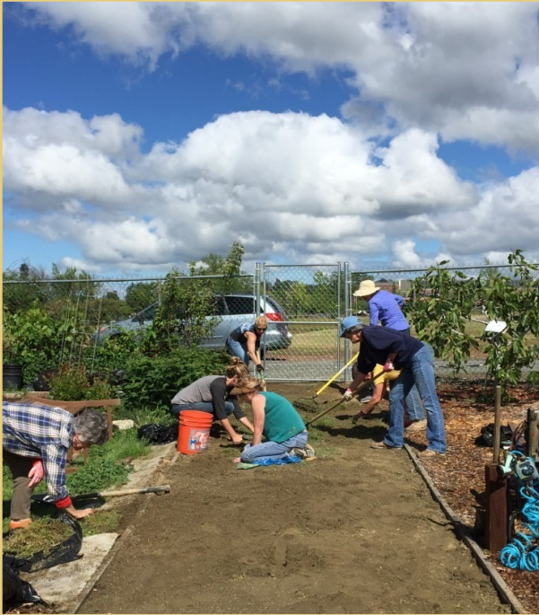
Placer County Master Gardeners get ready for their public workshop by clearing the main path to their garden areas. Not only do the Master Gardener volunteers use their gardens for education, but they also provide plenty of team building opportunities!