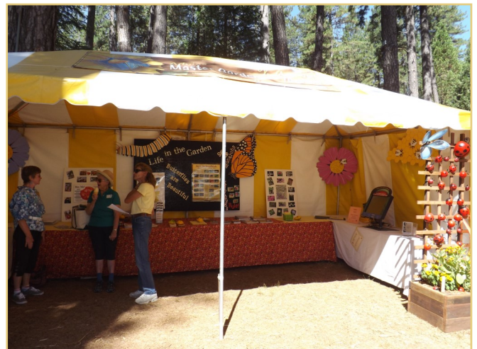
The Master Gardeners in Nevada County always do a great job of creating inviting displays to draw people in at the Nevada County Fair and Home and Garden show.