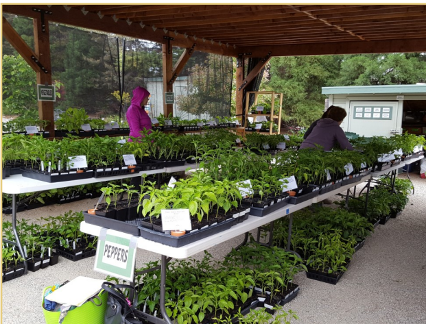
Nevada County Master Gardeners prepare for their 2016 Spring Plant Sale and fundraiser at their demonstration garden in Grass Valley. Hundreds of people buy their veggie starts here each year.