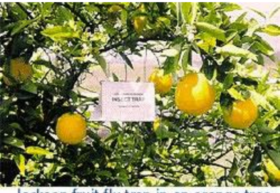
Jackson fruit fly trap in an orange tree.