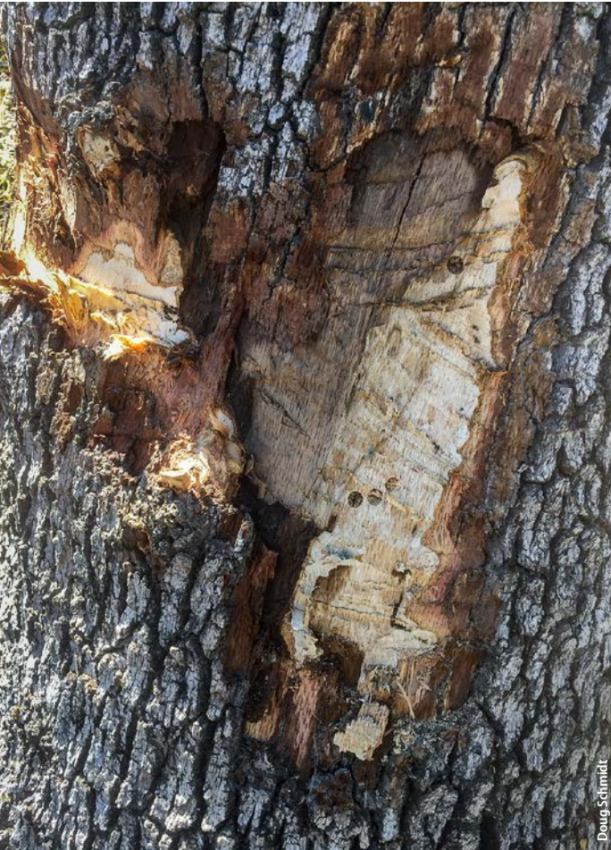
Wood tissue from a blue oak in Placer County with staining associated with developing Botryosphaeria canker.