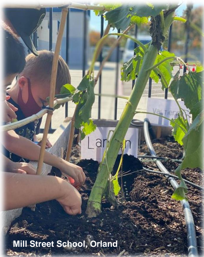
Mill Street School, Orland

Over 350 students at Mill Street Elementary got to plant seeds in their school gardens in October 2021. The students had so much fun planting peas and several unique carrot varieties!