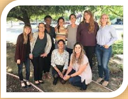
Climate Smart Community Education Team