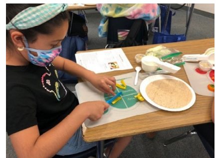
Learning food prep techniques as part of Cal Fresh Healthy living program