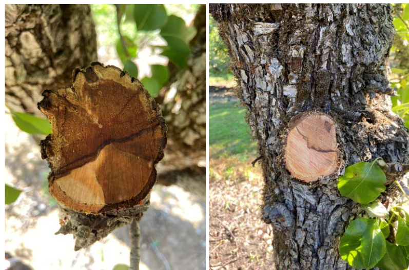
Figure 3. Canker on the main branches of pear trees.