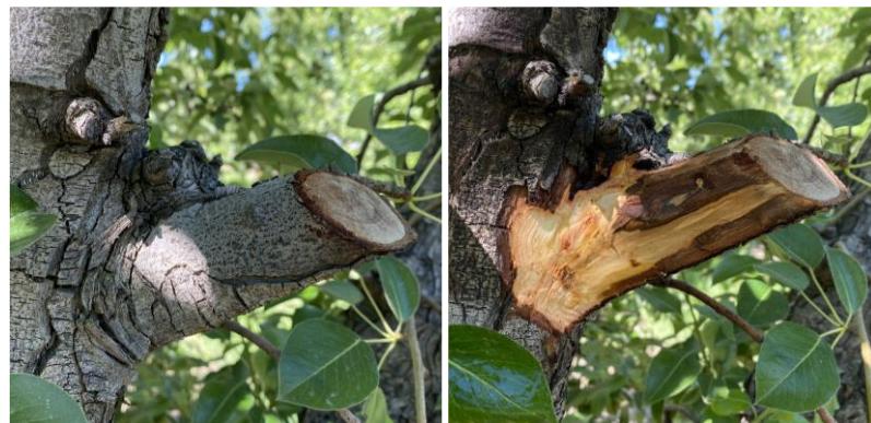
Figure 2. Necrotic tissue on pruning wound.