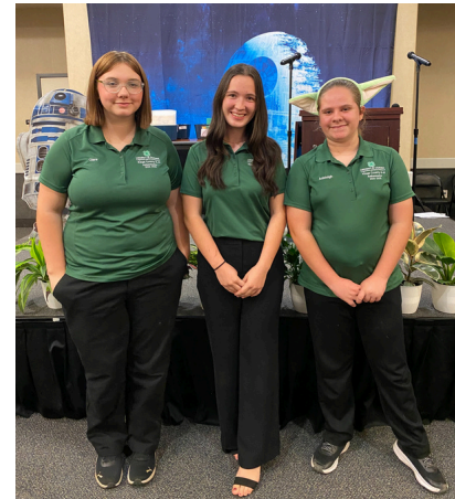
2024-2025 Kings County 4-H Ambassador Team

There will be an interest meeting for members and parents who would like to learn more about the opportunity on April 10th at 6:30 p.m. Applications will be made available in April.