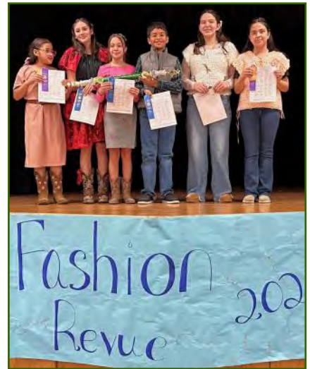
Pine Grove 4-H for Fashion Revue