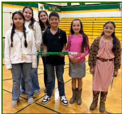
Pine Grove 4-H for Presentation Day

We showcase the club with the most spirit at each event with a club picture in the monthly newsletter.