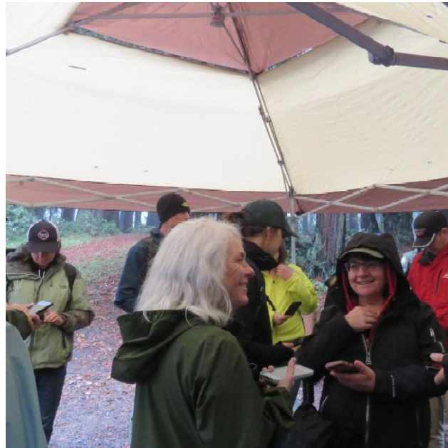
Forest Stewardship participants practice their mapping skills at a field day.