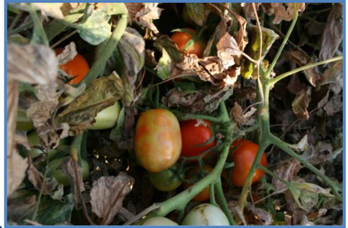
2 fruit symptoms with few foliar symptoms