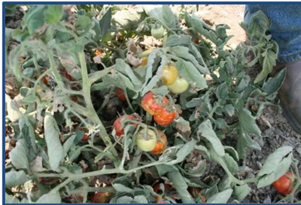
3 systemic symptoms through leaves and fruit