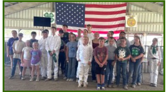
Burney 4-H Club