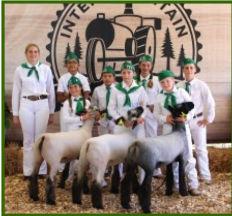
Evergreen 4-H won 1st place for pen of lambs.