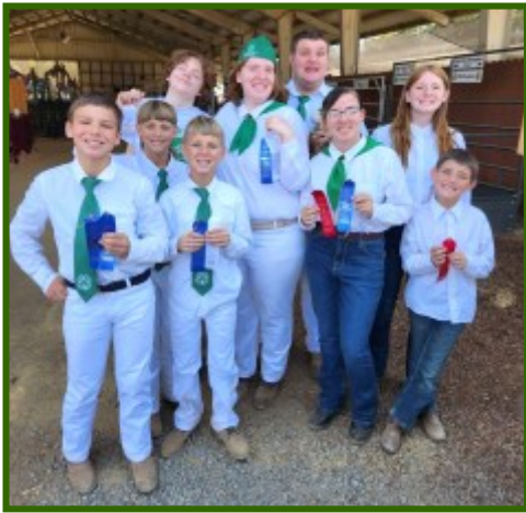
Burney 4-H Market Lamb members