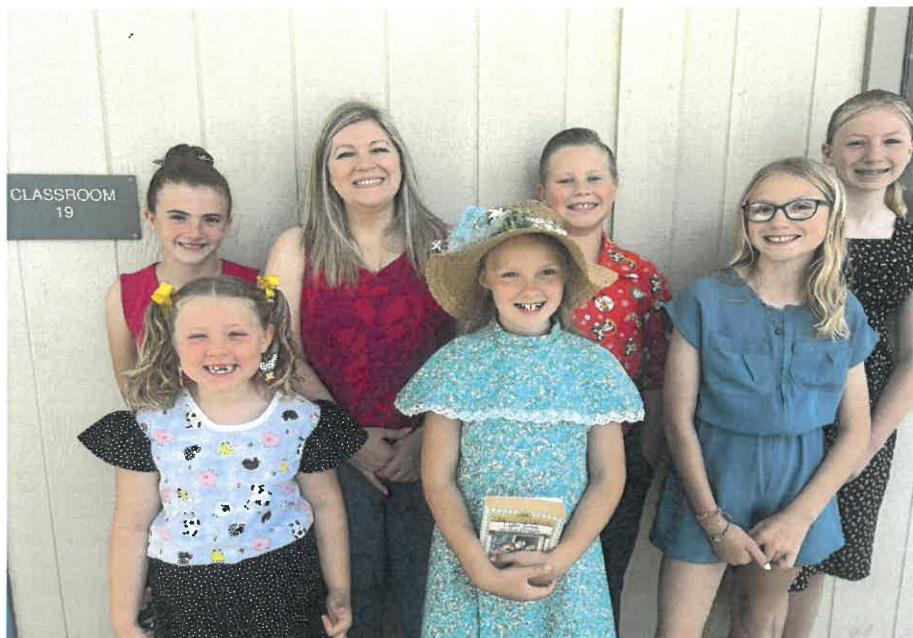
Above photo: Glenn County 4-H Sewing Project

821 E. South Street • P. O. Box 697 • Orland, CA 95963 • Phone (530)865-1107 • Fax (530)865-1109 • ucanr.edu/county/glenn-county