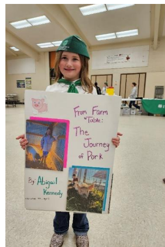
Figure 3: 1st-year 4-H member showing their presentation boards on "From Farm to Table: The Journey of Pork"