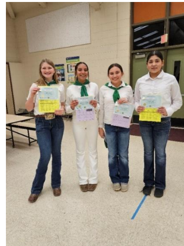
Figure 5: 4-H members excited to show off their awards.