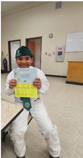
Figure 2: 1st-year 4-H member displaying their gold medal award.

Thank you to the volunteers who helped with tabulations and evaluating the presentations, the committee, UCCE Office staff, and Willows Intermediate School teachers and staff for allowing us to use their classrooms and facility. This event wouldn't be the success it was, without the support from volunteers and community members!