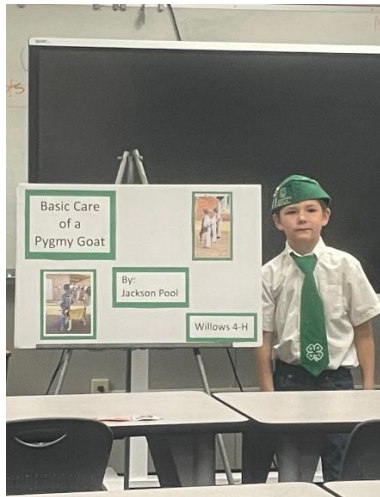
Figure 4: Primary member presenting "Basic Care of a Pygmy Goat."