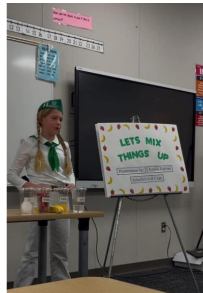
Figure 6: Youth member presenting "Let's Mix Things Up."