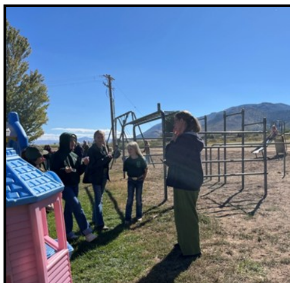
Milford 4-H Club at Wemples Pumpkin Patch promoting National 4-H week.