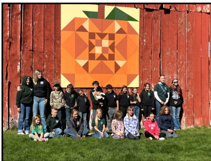
Milford 4-H Club at Wemples Pumpkin Patch

The Milford 4-H Club met on Sunday October 5 th at Wemples Pumpkin Patch. The club held their business meeting and took their annual group photo. After the meeting the club split into groups and visited with the public sharing information about Lassen County 4-H and National 4-H week. The club also gave out Wemples Pumpkin Patch hay rides tickets to families and kids they talked to. This was a fun way to celebrate national 4-H week with locals and others who visit the area.