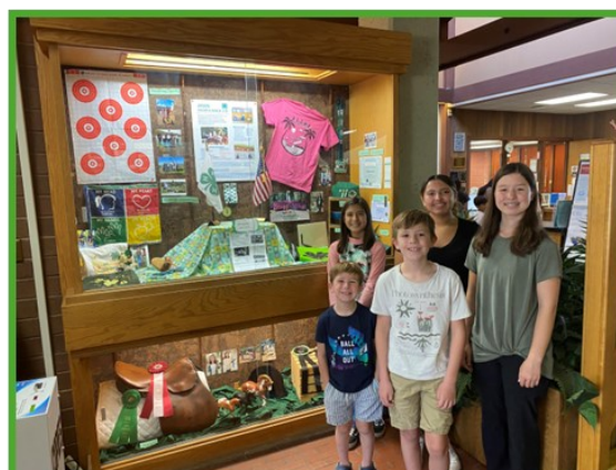
Top left to right: Lone Star/Fowler, McKinley, Reedley, Renegades