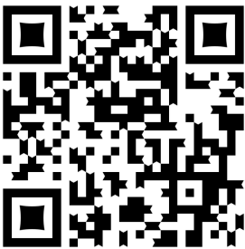
Marin County 4-H Website

University of California Cooperative Extension, Marin County (415) 473-2641 or kgulick@ucanr.edu