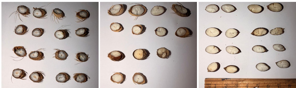
Figure 2. Randomly selected seeds of each of the three seed age categories were cut longitudinally and the colour of the endosperm and presence or absence of the embryo were noted; [ Left ] Seeds harvested from palm at zero months; [ Center ] Fallen seeds, which were in the field for one month; and [ Right ] Fallen seeds which were in the field for \geq three months.