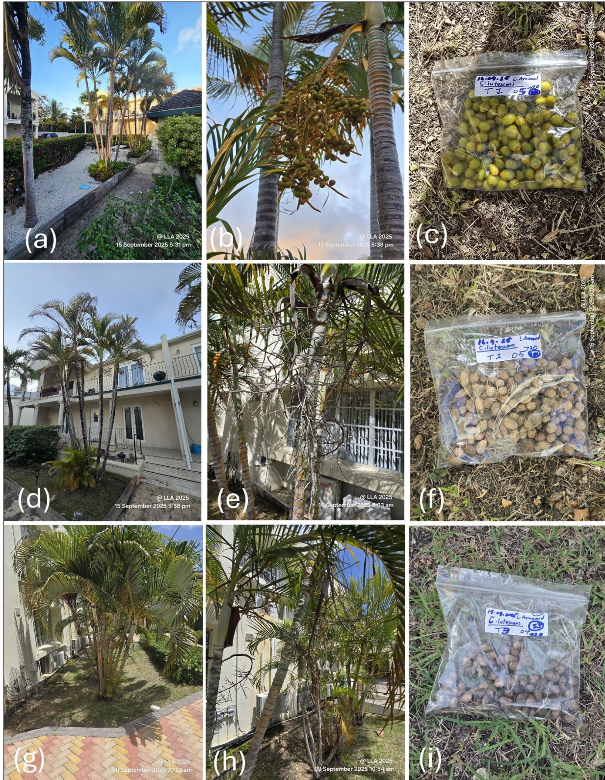
Figure 1. Representation of overall habit and fruit/seed stage of studied Chrysalidocarpus lutescens palms: [a–c] T1 (0 months); [d–f] T2 (1 month); and [g–i] T3 (>3 months).