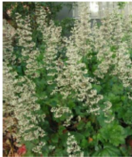
Heuchera-maxima - Island-Alum-Root4