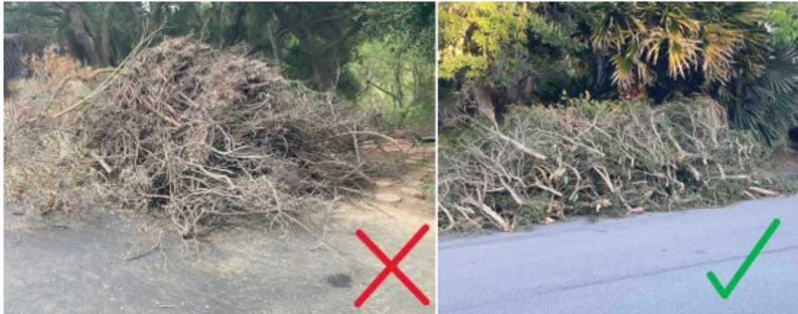
Bad Chipper Pile VS Good Chipper Pile