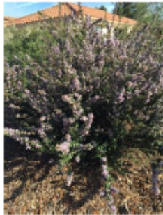
Ceanothus 'Blue Jeans'