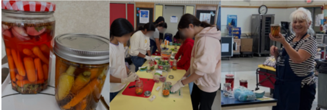
Photos by: Master Food Preserver Volunteer: Hapgood Elementary students and Lompoc Library families prepared quick pickles using colorful vegetables

In February, two youth-focused collaborations introduced participants to colorful vegetables and simple pickling techniques. At Hapgood Elementary, 20 students prepared quick pickles while practicing safe use of kitchen tools and safe food handling. At the Lompoc Public Library, 24 families joined a partnership program with UC Cooperative Extension (CalFresh Healthy Living, UC Master Food Preservers, and the UC Master Gardeners of Santa Barbara County). Participants learned pickling basics, soil and gardening connections, and made quick pickles using root vegetables to take home.