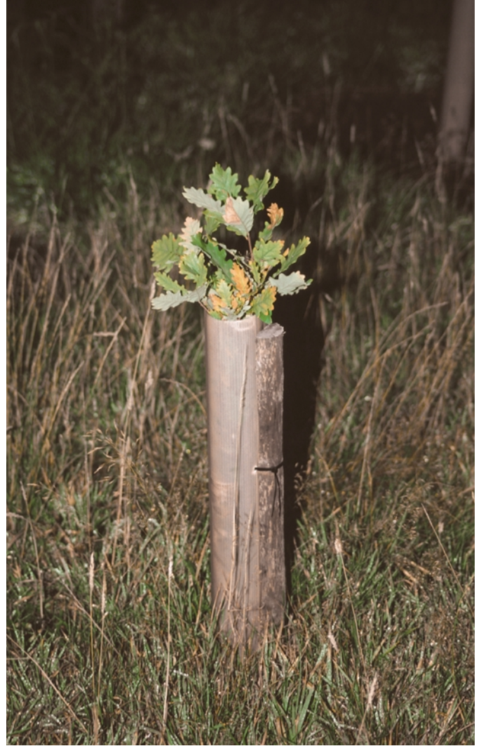
Figure 3. Maintaining an area of bare soil around young trees prevents other vegetation from competing for water and nutrients. The growth rate of the oak tree at left, planted in a 9-square-foot (0.8-sq-m) area of bare soil with sprouting weeds controlled by herbicide, surpassed the growth of a similar tree grown in turf (right). Both trees were planted as 1-year-old-liners in tree shelters.