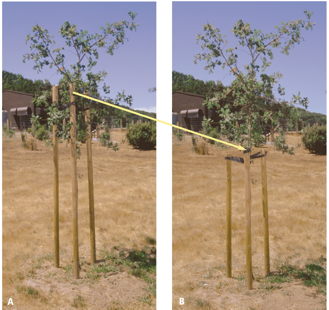
Figure 2. (A) Valley oak tied and staked too high. (B) Stakes and ties properly adjusted.

Newly planted trees may need staking for protection, anchorage, or support (fig. 2). The type of staking depends on the landscape situation and the ability of the tree to stand upright. The more freedom to move the top of a tree has, the better it is able to develop structure to stand upright and withstand storms. Stakes are not necessary for trees that can stand by themselves or are planted where little or no protection is needed. Most conifers, trees with upright growth habits, and trees planted bare-root usually do not need support.