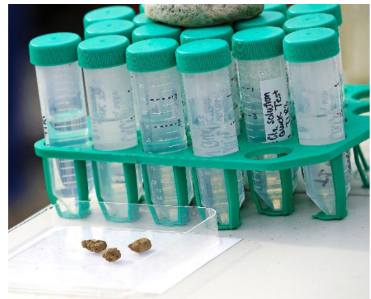
Example of in-field soil sampling materials.

Testing is critical to understanding how wildfire may have affected your soil. Laboratory soil testing is recommended, especially if the soil is currently being used or is going to be used for urban agriculture. Residents directly impacted by fire can access post-fire soil test results from their clean-up contractor or seek out testing themselves. DIY soil testing kits are not recommended for this type of testing because they cannot test for many contaminants or heavy metals that are of concern post-fire. To learn more about soil testing options, visit UC ANR's Healthy Soils for a Healthy California website ( https://ucanr.edu/sites/soils/ ), UC ANR's List of Laboratories