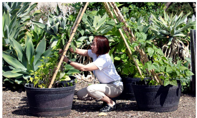
Examples of incorporating raised beds and other containers.