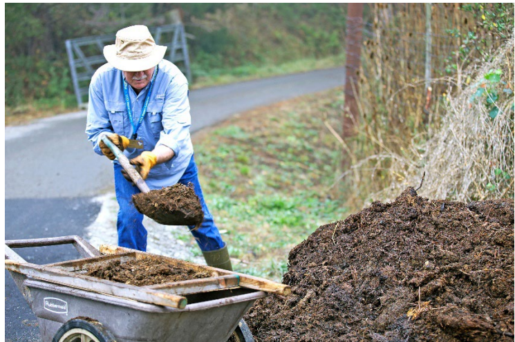
Person working with compost.

After determining the history and state of your soil, the next steps will depend on what your soil testing results indicate. If your soil test results indicate that no contaminants have been found exceeding acceptable levels, no immediate action is required for contaminant remediation. Most guidelines on acceptable levels of contaminants are meant for exposure through ingestion or skin contact rather than gardening. However, Table 1 illustrates what ranges of certain chemicals may be acceptable for home gardening. If your soil testing indicates that contaminants have been found at or exceeding acceptable levels, consider the following remediation strategies: