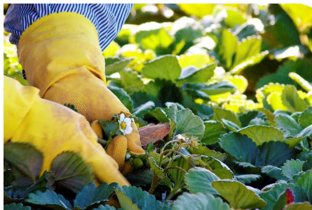
Wear gloves, a long-sleeved shirt, and other protective gear when interacting with contaminated soil.