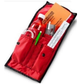
Figure 3: Belt weather kit

Walking around your proposed burn unit days in advance of your intended burn day is recommended as you can gather site-specific information about on-site weather, such as wind patterns throughout the day or on differing slopes. Documenting onsite weather data using a handheld weather instrument, such as a Belt Weather Kit (Figure 3) or a Kestrel (Figure 4), is helpful if you can access those tools, but is not necessary.