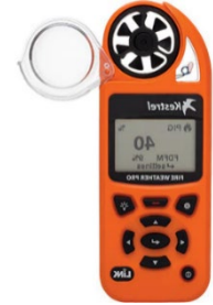
Figure 4: Kestrel weather meter