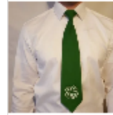
Ties & Collars