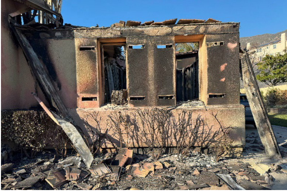
Figure 3: These woody shrubs likely contributed to the radiant heat damage that broke the window in this home. Implementing a 5-foot noncombustible perimeter is best practice.