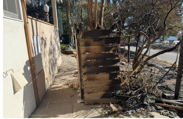
Figure 4: Fire personnel cut away the gate to keep the fire burning along the fence from reaching the house.

Once a portion of a building ignites, it generally takes some form of human intervention to prevent further fire spread. In big conflagrations like the Eaton and Palisades fires, where crews are spread thin, small interventions can be very effective. These may include removing fence panels to prevent the fire from traveling to the house, spraying water on burning vegetation, moving a burning door mat, or using an axe to cut away burning vegetation. These actions largely contributed to homes surviving the 2025 Los Angeles Fires. In the days and weeks following damaging fires, scientists and crews from CAL FIRE collect data to answer critical questions about whether there are signs of home hardening actions or defensible space in action. More detailed studies, such as those done by the National Institute of Standards and Technology (NIST), take much longer and involve reconstructing fire progression through in-person interviews, reviewing security camera footage, and extensive fieldwork.