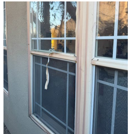
Figure 6: Radiant heat damaged this window. Note the vinyl glazing is deformed. In some cases, radiant heat led to window panes breaking or falling from the frame.