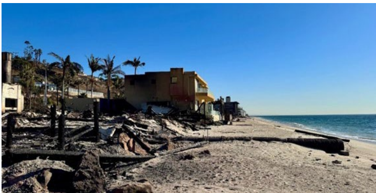
Figure 2: The Palisades Fire burned to the beach, taking many homes along the coast in its path. Some of the surviving buildings illustrated effective home hardening, such as having dual-paned tempered glass windows.

noncombustible siding. Dual-paned windows perform far better with radiant heat exposure than single-pane windows, which are common in buildings built before the 1970s (and in most homes in these fire footprints).