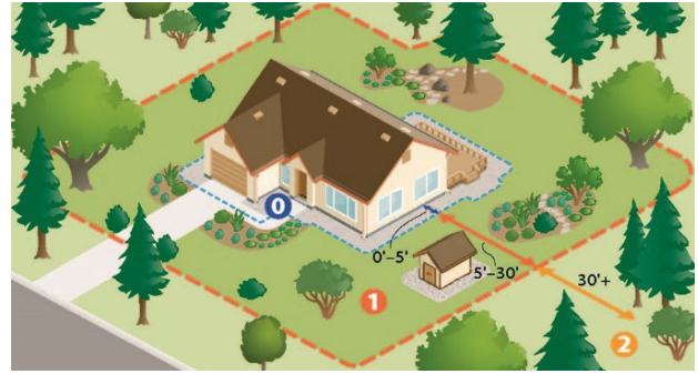
Figure 5: California's 3-zone defensible space system is critical for fire mitigation.