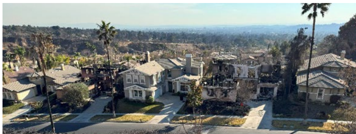
Figure 1: Not all homes burned in the 2025 Eaton Fire. In most cases, fire suppression activities were key to building survival.

Post-fire studies and laboratory experiments offer essential information about how local construction and landscaping practices affect building and property vulnerabilities. Assessments following the 2025 firestorms in Los Angeles provide key information and add to the body of research following other destructive wildfires in California, Colorado, and Hawaii over the last decade.