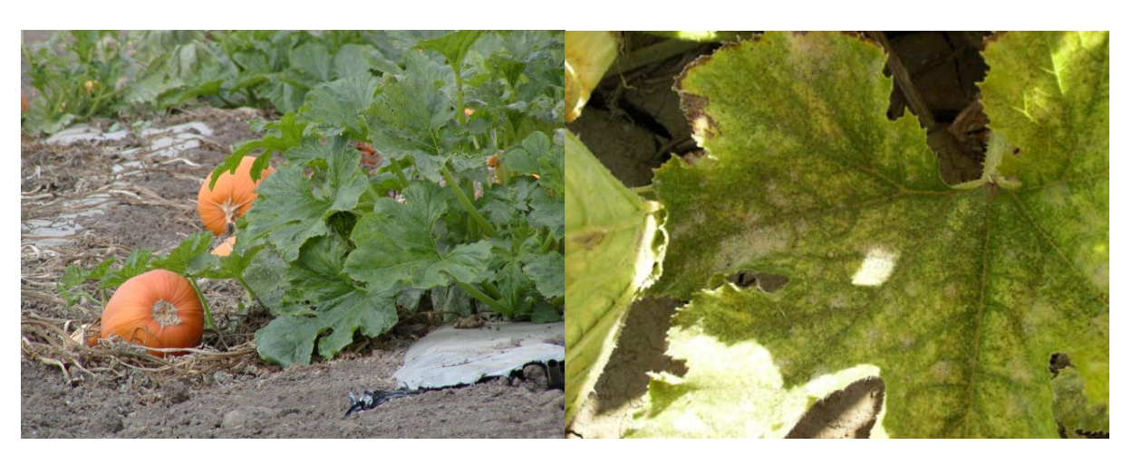
Figure 1. a) Pumpkins in field at maturity and b) Pumpkin leaf showing powdery mildew.

We conducted a field trial at the UC Davis plant pathology experimental farm in Solano County, California to evaluate the effectiveness of 'soft-chemistry' and synthetic fungicides in managing powdery mildew on pumpkins ( Cucurbita pepo ) using the susceptible cultivar 'Sorcerer'. We applied fungicides every 7 to 14 days for a six week period beginning Aug 22 and continuing through Oct 3. Following four or seven applications, depending on treatment, we assessed disease incidence and powdery mildew colony density on the upper and lower surfaces of leaves in each treatment.