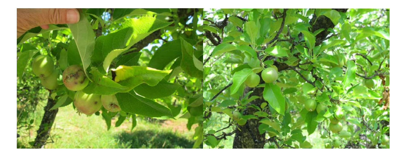
Figure 1. Apples at disease evaluation. A) Untreated Control B) Treated with Sovran.

We conducted a field experiment near Camino, El Dorado County, California (elevation 3200 ft) to test the effects of several registered and experimental fungicides on control of apple scab in mature Golden Delicious Trees. Four applications were made from early March (green tip) to late April 2013 (petal fall). We compared disease levels obtained on foliage and fruit in untreated trees with disease control exhibited by various products in combination, with and without adjuvants, and in alternation with other products.