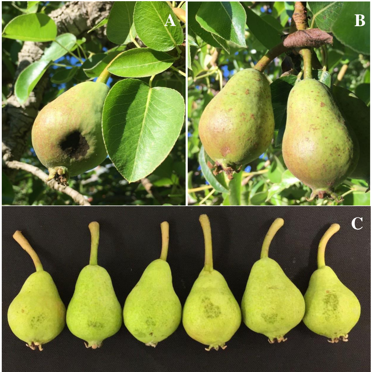
Figure 3. A) Pear scab lesion on fruit from untreated control. B) Symptoms of phytotoxicity on fruit treated with Cueva and Mastercop. C) Symptoms of phytotoxicity on fruit treated with Rango and Terramera Biological.