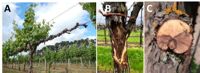
Figure 3. Botryosphaeria dieback, commonly known in California as 'Bot canker' is caused by multiple species in the Botryosphaeriaceae family. Characteristic symptoms are the lack of spring growth of infected areas, including cordons (A) or spurs (B). Cross sections of infected parts reveal a wedge-shape canker (C). The GTD disease known as Phomopsis dieback and primarily caused by the fungus Phomopsis viticola shows very similar symptoms as Botryosphaeria dieback.