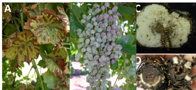
Figure 1. Leaf (tiger stripes) (A), fruit (black measles) (B) and vascular (C) symptoms caused by esca disease complex. Esca (black measles) and petri disease are primarily caused by the vascular pathogens Phaeoamoniella chlamydospora and Phaeoacremonium minimum , which are also involved in Petri disease in young plants (D).