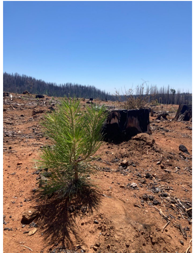
Figure 2. A healthy ponderosa pine seedling planted by the Caldor EFRT on private land in 2023. Severely burned, untreated forest land can be seen in the background.

for program-level work. Preparation ahead of a fire in the form of funding and guidance would improve program development and implementation, as would guidance from experienced local lead agencies once a fire has occurred.