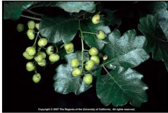
Pacific poison oak with fruit.