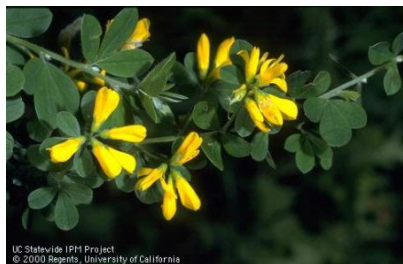
Scotch Broom flowers.