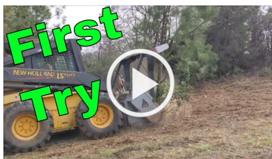
First use with a masticator in a forested setting video

A pesticide is any substance "intended for preventing, destroying, repelling, or mitigating any pest"... including antimicrobials, herbicides, and bug repellents. Plant growth regulators, defoliant, desiccants, and nitrogen stabilizers are also pesticides. - National Pesticide Information Center